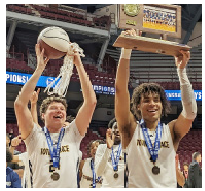
Celebrating state championships on Saturday were Breck (top), Totino-Grace (above right), Cherry (below right) and Minnetonka (below) at Williams Arena.