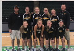
New London-Spicer 8th Grade Girls 2017 Great Four-State Champs

Minnesota won 5 of the 12 GREAT STATE CHAMPIONSHIP TITLES!