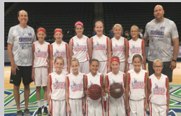
Detroit Lakes 5th Grade Girls 2017 Great Four-State Champs

Top two teams at STATE advance to Target Center in Minneapolis.