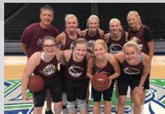
Sauk Centre 9th Grade Girls 2017 Great Four-State Champs

Wisconsin joining in 2018! MN - IA - ND - SD - WI