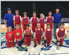
ML/WR 5th Grade Boys 2017 Great Four-State Champs

Wisconsin joining in 2018! MN - IA - ND - SD - WI