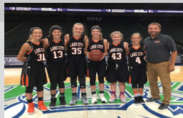
Lake City 7th Grade Girls 2017 Great Four-State Champs