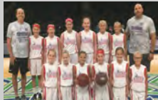
Detroit Lakes 5th Grade Girls 2017 Great Four-State Champs

Top two teams at STATE advance to Target Center in Minneapolis.