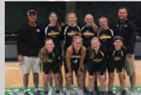
New London-Spicer 8th Grade Girls 2017 Great Four-State Champs

Minnesota won 5 of the 12 GREAT STATE CHAMPIONSHIP TITLES!