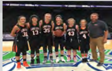
Lake City 7th Grade Girls 2017 Great Four-State Champs