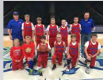
ML/WR 5th Grade Boys 2017 Great Four-State Champs