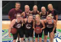
Sauk Centre 9th Grade Girls 2017 Great Four-State Champs

Wisconsin joining in 2018! MN - IA - ND - SD - WI