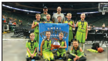
Thompson - 4th Grade Boys 2017 Great Four-State Champs

Region Champion and Runner-up are invited to the North Dakota State Championship April 14-15 in Jamestown. Top two teams at STATE advance to the Great Five-State Championship at the newly-renovated Target Center in Minneapolis.