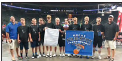
Kindred - Richland - 9th Grade Boys 2017 Great Four-State Champs