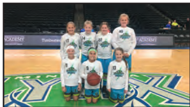
Bismarck Energy - 4th Grade Girls 2017 Great Four-State Champs