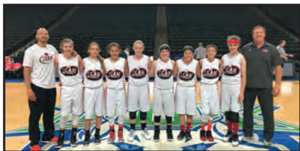
Bismarck Intensity - 6th Grade Girls 2017 Great Four-State Champs

All grades refer to the 2017-2018 school year.