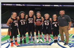
Lake City 7th Grade Girls 2017 Great Four-State Champs