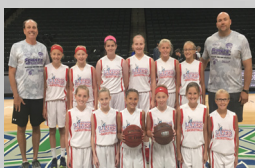
Detroit Lakes 5th Grade Girls 2017 Great Four-State Champs

Top two teams at STATE advance to Target Center in Minneapolis.