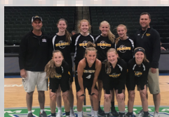
New London-Spicer 8th Grade Girls 2017 Great Four-State Champs

Minnesota won 5 of the 12 GREAT STATE CHAMPIONSHIP TITLES!