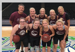
Sauk Centre 9th Grade Girls 2017 Great Four-State Champs

Wisconsin joining in 2018! MN - IA - ND - SD - WI