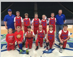
ML/WR 5th Grade Boys 2017 Great Four-State Champs

Wisconsin joining in 2018! MN - IA - ND - SD - WI